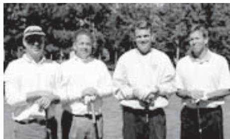
Butler County Landfill Team

First Place - Hewlett-Packard Second Place - Butler County Landfill