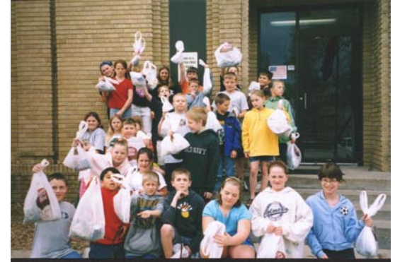
North Bend Elementary Students

Keep Nebraska Beautiful sponsors a "Litter Free School Zone Program". Schools agree to pick up any litter around their school grounds on a regular basis and many sponsor their athletic and other school events as litter-free so attendees have the expectation to be responsible for their own trash. Keep Nebraska Beautiful provides each participating school with a sign (much like a Drug-Free School Zone sign) to place outside their school to remind people passing by the school not to litter.