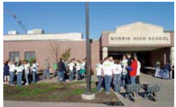
Teams assemble to begin the Wrigley's Greenup Event.