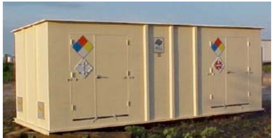
New Household Hazardous Waste Storage Facility in Kearney will be fully installed and ready for use in the near future.

These facilities will allow residents to bring in household hazardous waste products throughout the year assuring they will be handled in a safe manner.