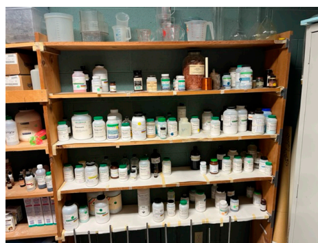
Paxton High School Chemistry Closet

inventories once the time came. Together, such efforts ensured that schools were equipped to implement and manage their own local programs before a single chemical was removed.