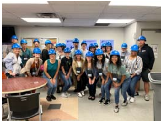
Conference participants tour FirStar Fiber